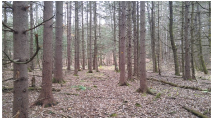
The trail as it winds through a stand of pine.

It is hoped that the final work parties will come right after the close of hunting season and prior to