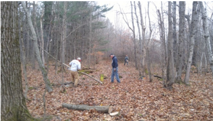
Tom and Laudy remove limbs and logs from C7E.