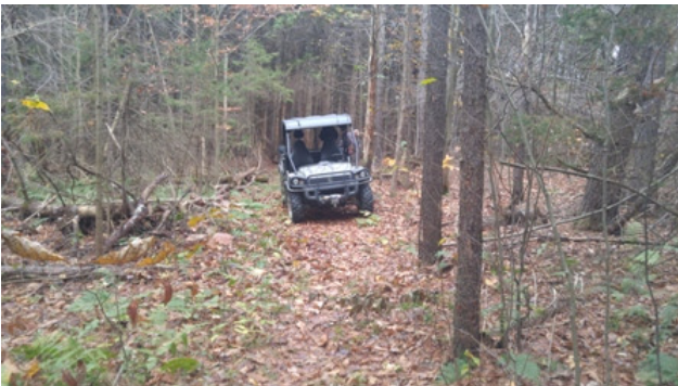
UTV's help move the equipment through the woods.