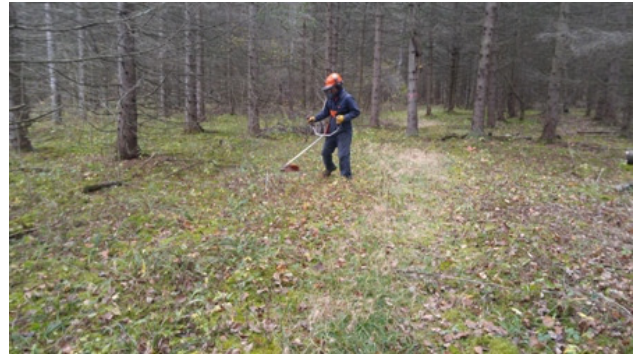
Gerry Lenseth brush cutting the trail open.