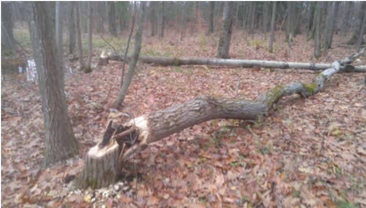
The beaver have been busy near the Burtonsville Road.