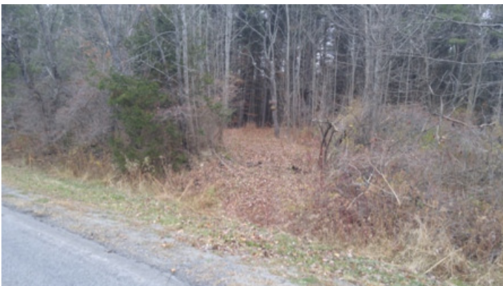
Trail entrance at a road crossing.