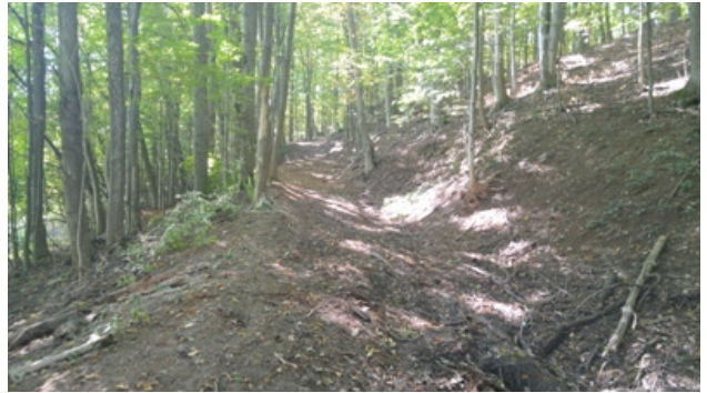
The cut in the hillside provides an easy climb up the hill.