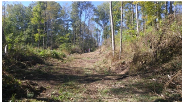
The same section as above, now ready for snow!