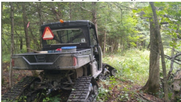
The tracked Ranger climbs the hills with ease.