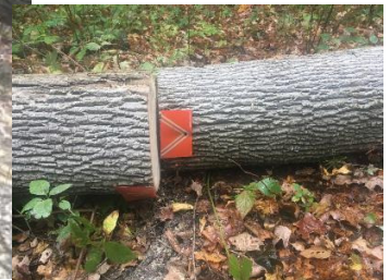
An unfortunate trail marker...