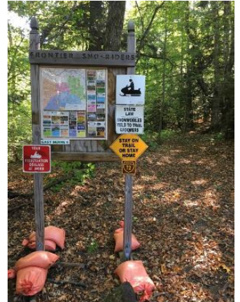
The new home for the old kiosk, Thatcher Park entrance, S72.