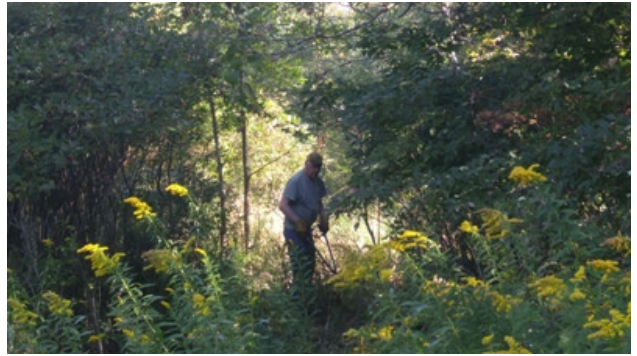
Laudy Hoyenga prunes back tree limbs on C7E.