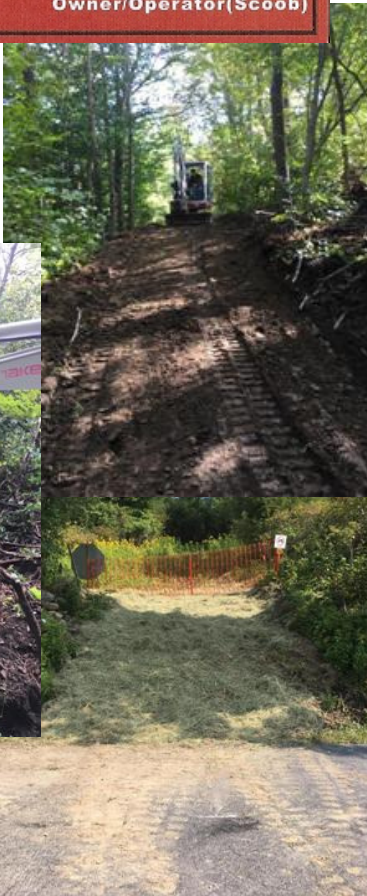
C7B at the Turner Rd crossing has been reworked, not so steep.