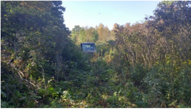
Sep 18th, cutting thru the brush below Zarcarco Rd.