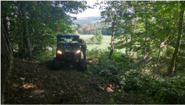
At the forest edge, the trail dumps into a big field.