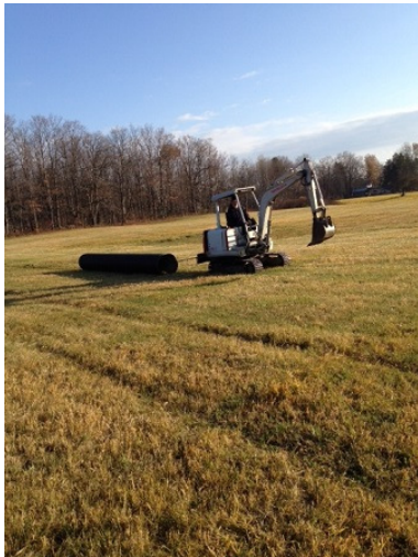
At left a new culvert is towed out to the stream crossing on C7B near Weaver Rd.