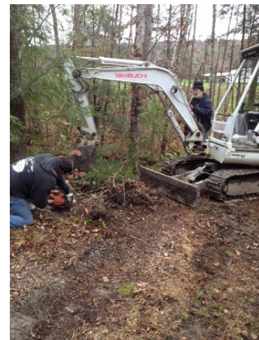
Full force trail work with Karl's equipment ,dig ditch parallel to trail, raised trail, straighten and removed stumps

Brian Buchardt and Karl Pritchard hard at work and having fun improving the trail. Chainsaws and polesaws are just some of the tools used to brush and clear trails.