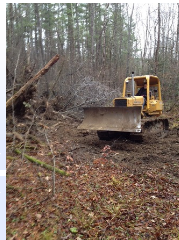
Karl pushing uprooted trees off the trail