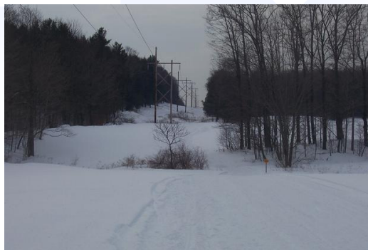
Trail C7B along side the power lines.

Another feature unique in the valley is the rail road. This line is very active and requires that all snowmobiles remain off rail road property. Snowmobiles are only allowed to cross over tracks at gated auto crossings. Trail C7B does pass under the rail road, while C7E uses a gated crossing.