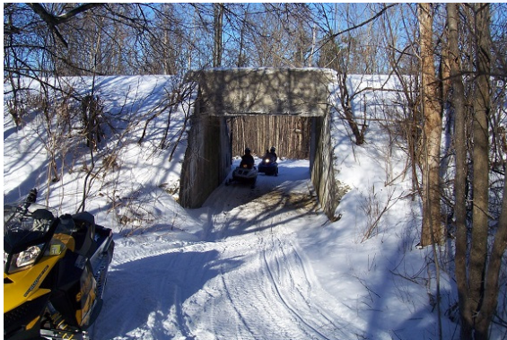
Riders use the cattle-pass under the railroad on C7B in Duanesburg

Centrally located the Duanesburg area offers many choices on which direction to go. A number of trails intersect here, creating a hub. Heading north to Mariaville, west to Sloansville, or south to East Berne might make the decision tough.