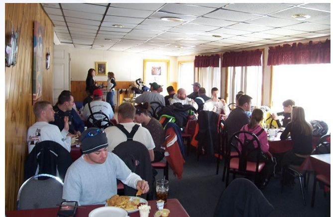
Snowmobilers enjoying food at Jonathan's at the end of a club ride.