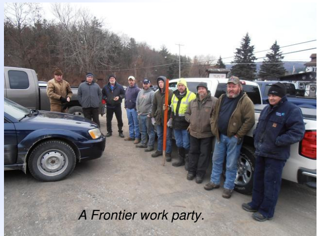
A Frontier work party.

local business during the winter. I hope everyone had a fun and safe riding season and if you have any questions about the club or are willing to get more involved, please attend any of our meetings throughout the year, watch the club website for meeting locations that are held the second Wednesday of the month. Finally, I personally want to thank all the Board Members, Trustees and Trail Bosses for all your time and efforts to make Frontier Sno Riders the great club that it is.