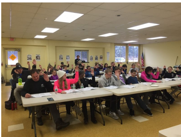
The Safety class 2014-15.

riding. With all the work that's involved to get