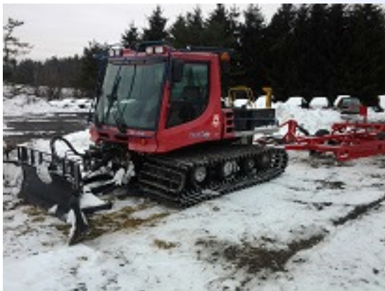
Frontier's Piston Bully 100.

The last half of this winter brought for some great riding along the Frontier Sno Riders Trail system. How do I begin... It all started mid-August when the trail bosses began putting together work parties on the weekends to begin clearing trails, putting in bridges, proper drainage were needed, re-routes where necessary and signage, etc. This is definitely an area the club needs more help with -- having more members help at the different work parties that are posted on the Club Website and different email blasts that are sent out are crucial to making our trail system even better. Our goal as a club is to get as many trails rated as class A, which means a lot of trimming back so we have 10 to 12 feet wide trails.