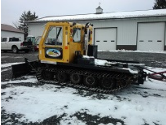
Bombardier Ski Dozer.

no frost in the ground to hold the snow longer before it all melted away. If only we were able to hold that