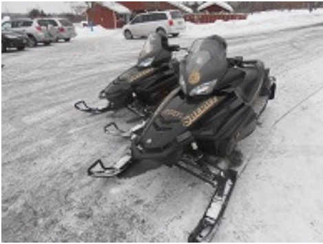
Albany County Sheriff patrol snowmobiles.