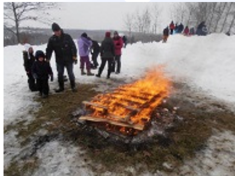
A bonfire helped warm a very chilly day.