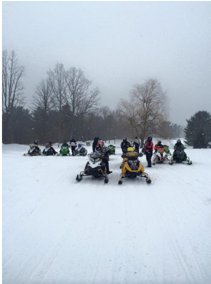
The meeting point at the Knox Town Park heading south to the Maple Inn.

The ride, trails and weather were good, about 28 people made the journey for dinner at the Township Tavern.