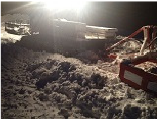
Night time is when you may encounter the groomers, so stay alert.