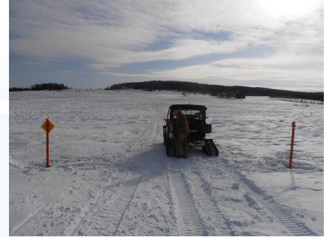
Laudy's side by side works not only as a groomer but also carries sign posts, a generator, and tools for putting in the posts.