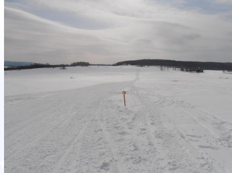
After staking the field, riders stay on the trail. Laudy drills a post hole in the frozen ground.