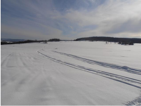
Before field staking on C7F the trail wanders... Laudy Hoyenga and 2 groomers from Frontier hit the big field on C7F