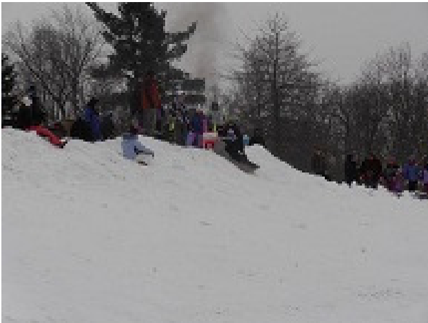
Children launch their sleds from the top of the hill.

sledding hill for the children to ride down. The Club also set up a table for answering questions about snowmobiling and selling Club merchandise.