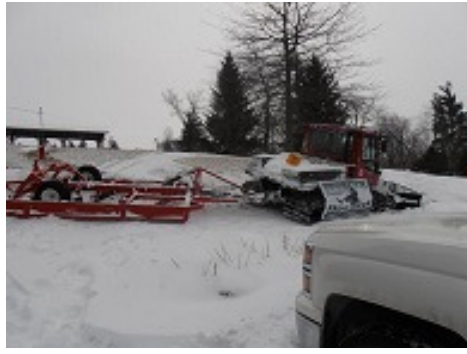
The Frontier Piston Bully and drag sporting the Club banner.