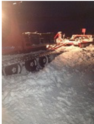
Grooming the trails is a round the clock detail. Please remember you could meet a groomer at any time.