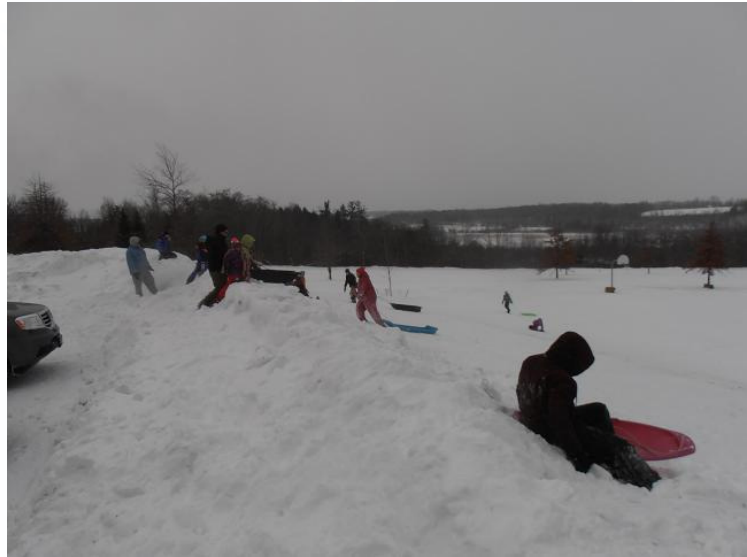
Lots of people came out to enjoy the Winterfest.