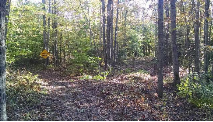
A new route to the new bridge on C7E in Delanson stays to the right. The old trail is still marked with Bridge Ahead.