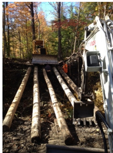
Right- New bridge beams are set in place on C7E in Delanson.