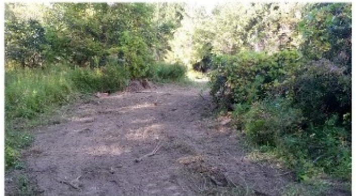
The opening is 15' or so, but is still somewhat a tight turn.