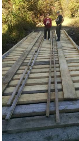
Newly decked bridge at Scott's Printing on C7B in Duanesburg.