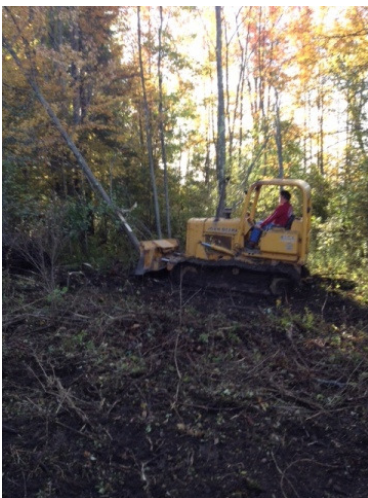
Left- Karl Pritchard moves a tree back in Knox.

Attendees must be at least 10 years old to take the class. Adults are encouraged to attend as well. This course is for all skill levels, from novice to expert. You are never too old to learn something new. Classes fill up fast, please call now to reserve your spot. Another class may be scheduled, if demand warrants. To sign up, Please contact Mike Riek 518-861-5115.