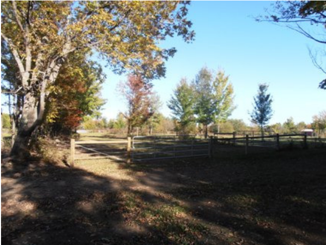
New cattle fencing and gates will require slow speeds to pass through the area on C7B near Westfall Road.