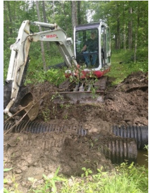
Installing culvert tubes.