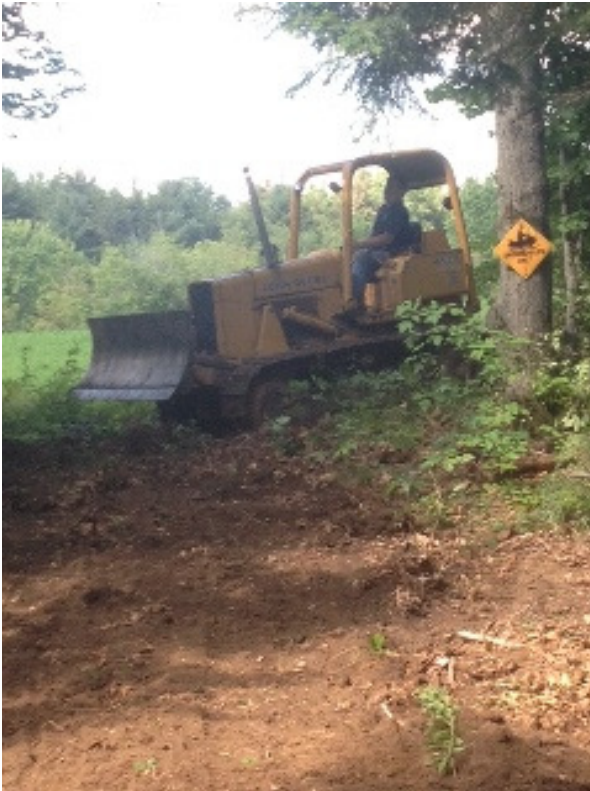
Karl smooths S-72 trail with a dozer.