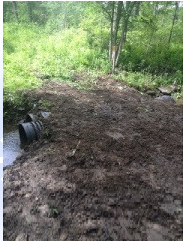
The finished trail crossing.