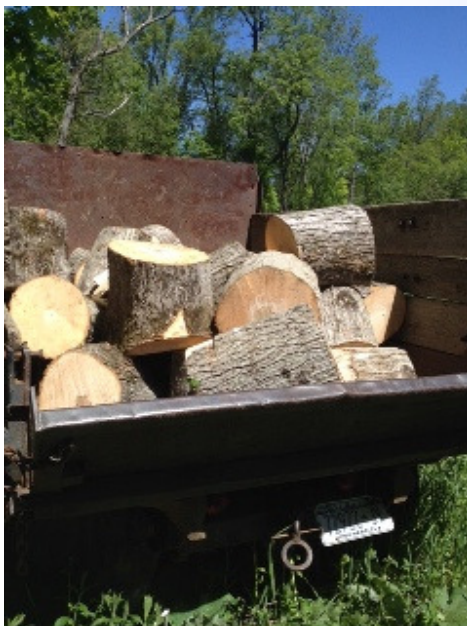
Rounds from the tree, all loaded.

Trail prep includes the removal of fallen trees, the cutting back of overgrowth, bridge maintenance, and sign placement. More intense work can involve bridge and culvert installation.