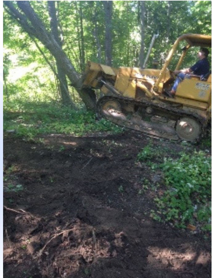
Trees are no match for the mighty dozer!