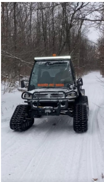
The 2012 Gator grooming.

Small things can have big impacts. While a small field seems easy to re-route around, it can be impossible when a large land-owner nearby denies access. A single rider or small group can ride off trail and close an airport trail for many. The Club is now beginning the behind the scenes tasks. Planning for trail upgrades, bridge and culvert repairs, grant documentation, are just some of