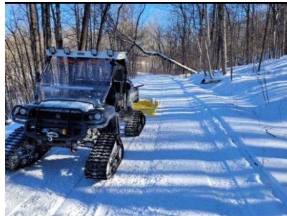
Trail S70 in Duanes- burg,