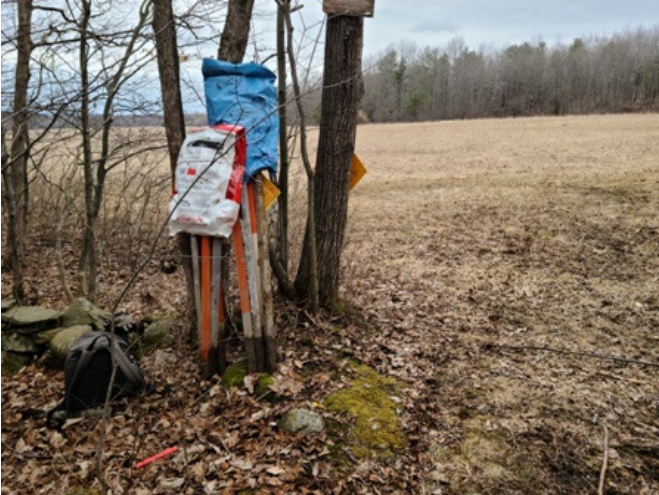
At left: sign posts have been gathered and bagged for the off-season at Blue Heron airport, C7B.