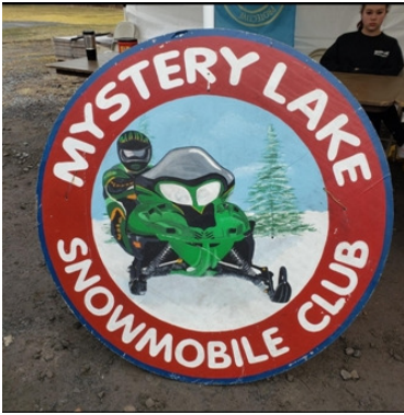
Mystery Lake Snowmobile Club, Ravena, NY hosted a vintage snowmobile show and swap meet.