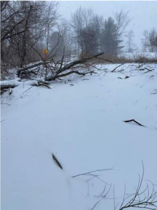
At left: High winds brought down this tree on S72 in East Berne.