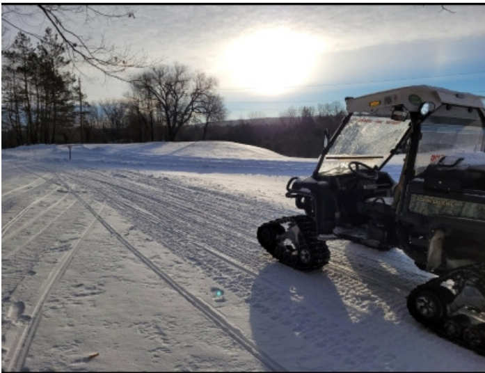
2011 Gator grooming in Duanesburg.

The snowmobile season ended quickly for the Frontier area. Warm weather and the lack of major snowstorms took away any chance to keep trails open into early spring.