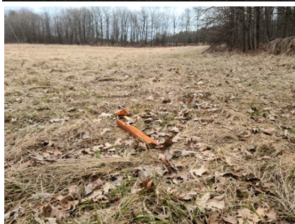
Some of the casualties of this season...