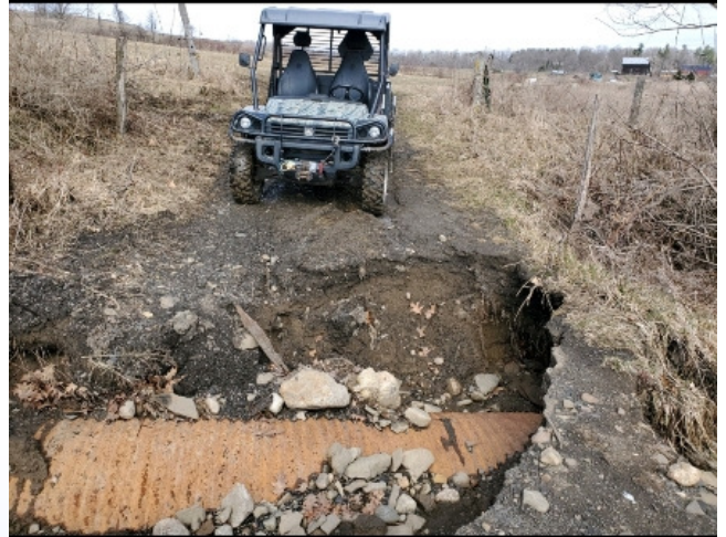
Heavy rains caused numerous washouts like these two culverts up near Rt161 in Glen, the very northern end of C7E.