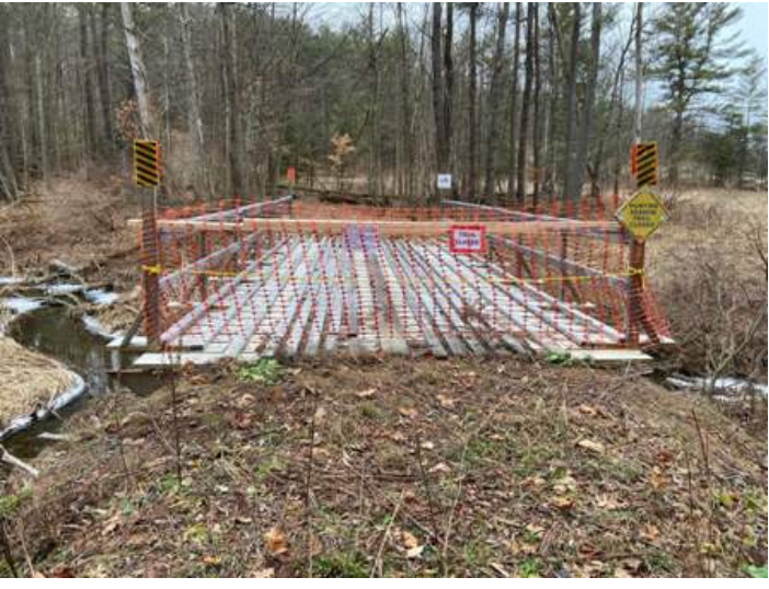
Trail C7B near Webster Rd is blocked off closed at both ends. The Rt 146 bridge is closed. The gates are closed.