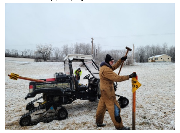
ple club jobs. This means there is plenty of help needed.

There are a number of members who hold multi-