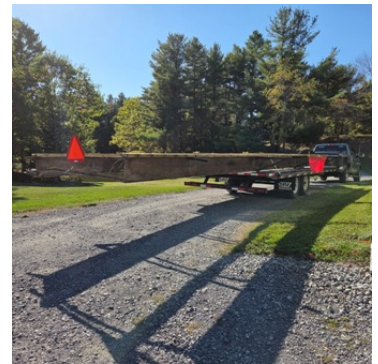
Loading the frame and delivery to storage.