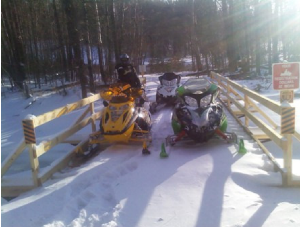
Early years on the 146 Bridge, circa 2010.

The C7B snowmobile bridge near the Rt 146 crossing above Gallupville was removed the last weekend of September.