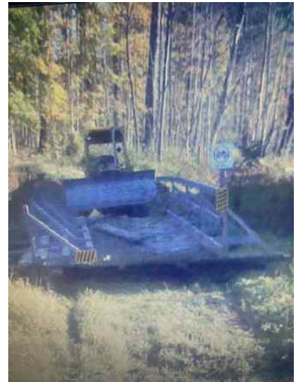
Pulling the bridge back.

Retrieval and re-setting the bridge upon a higher abutment resulted in reopening the trail.