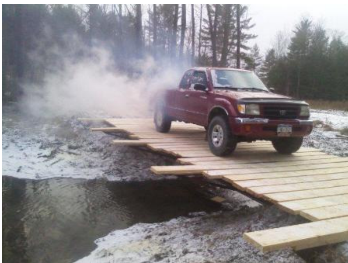
Ron Shultes tests the bridge strength.

The beaver built a dam just up stream of the crossing which held back an