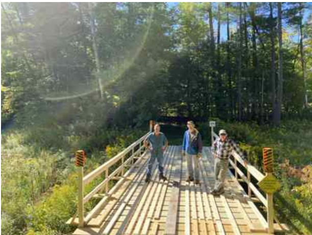
New decking and rails in 2020.

The 146 Bridge gave great service to the club and it's members for many years. Only through the kindness of landowners did this bridge and trail exist. Both are no longer there.