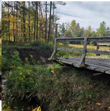
Removal of the 146 Bridge, September 2025.