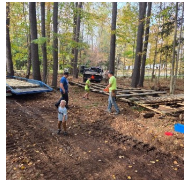
Stripping away the rails and decking.