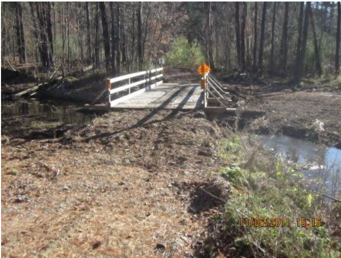
Reset, raised and ready for snow! November 2011

The 146 Bridge gave great service to the club and it's members for many years. Only through the kindness of landowners did this bridge and trail exist. Both are no longer there.