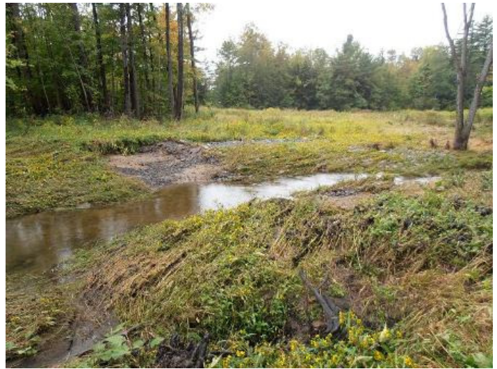
Post Irene, the bridge is missing. 2011.

In late August 2011, Tropical Storm Irene wrought serious damage on Frontier's trail system. The 146 Bridge, with barely two seasons of