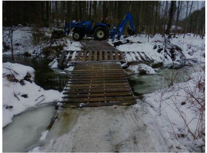
Pallets were used before the bridge. Circa 2008.

Club seeking a volunteer to design and maintain online store for Frontier merchandise and promotional material. Interested parties contact President Gerry Lenseth at 518-330-7373.