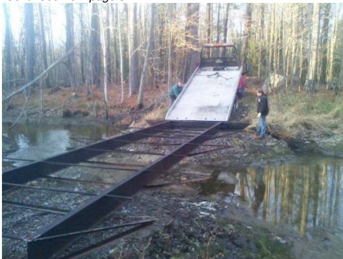
Karl Pritchard delivers the bridge frame.