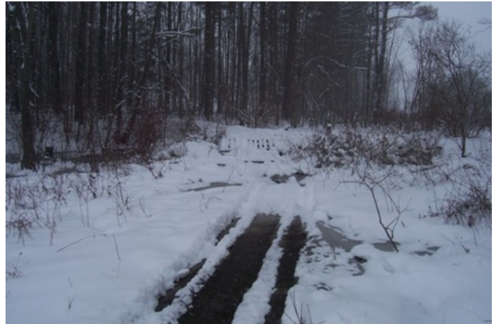
A damp crossing was common. Continued on page 5

Early trail riders will remember crossing King Creek usually meant running the risk of getting a little wet. While not a deep body of water, King Creek was wide enough and moving through the winter as to not allow the ice to get very thick.