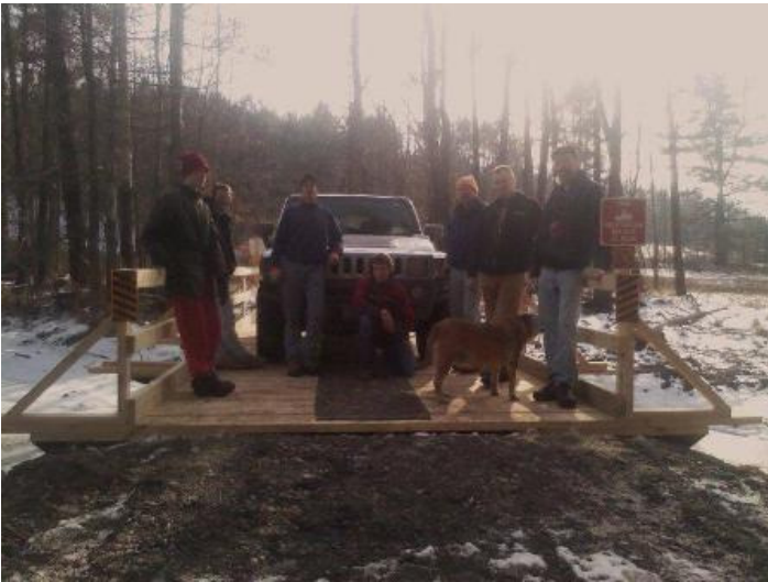
The 146 Bridge is ready for snowmobiles! 2009.

impressive amount of water at times. Any small aids to keep snowmobiles dry, such as pallets, would be swept away at the first melt off.