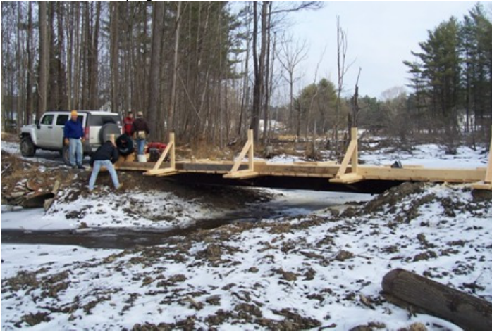
The span over King Creek.

impressive amount of water at times. Any small aids to keep snowmobiles dry, such as pallets, would be swept away at the first melt off.